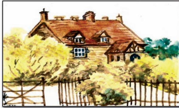
The Oaks - a painting from 1946